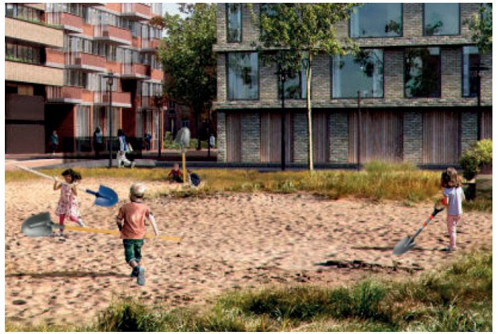
illustration of a common ground at rendering of saref building in sluisbuurt

the project “hosting soil: as a gift” thinks of the first and future inhabitants of a neighbourhood and how to arrive in a community. it offers a new perspective on the welcoming gift, and encompasses a ritual that refers back to the soil on which the houses are built and with which the buildings are possibly heated. the presented proposal responds to the topic: “social gestures and collective practices in the arts by raising awareness for sustainable and need-based subjects such as the commons in society.”