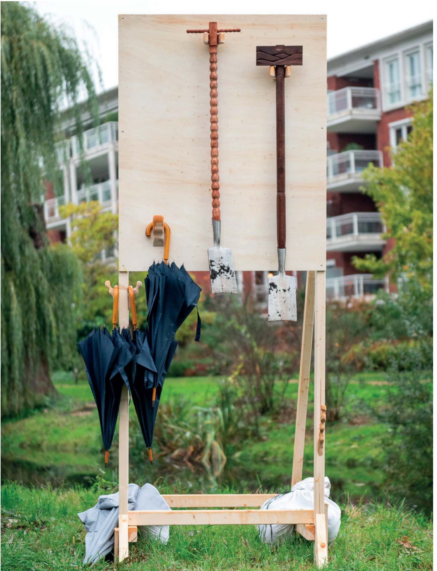
cabinet prototypes by kitty maria