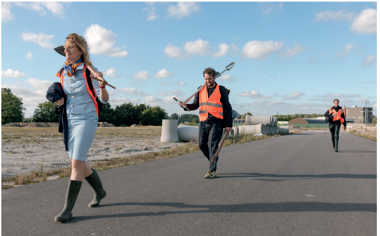
testing shovels in sluisbuurt