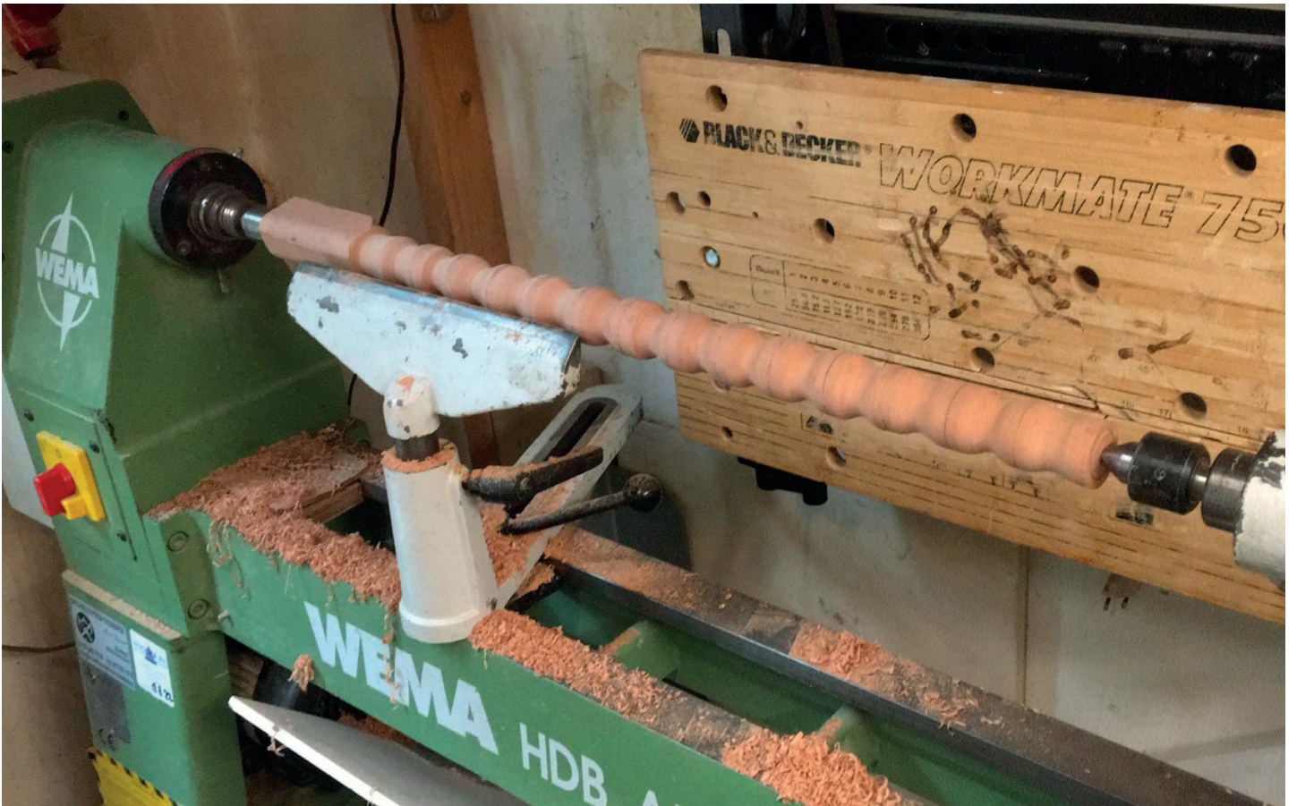
prototype production for shovel