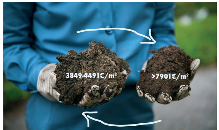
annual performance with saref inhabitants based on soil swapping performance

the performance hosting soil is based on amsterdam zuid’s urban development and is an ephemeral public art work taking place at the lowest and highest priced pieces of soil. how do tall tales spread through towns? what meaning can be given to a square meter of seemingly random sand? how do we make something as unapparent as the underlying economic structures of a cities’ soil visible? the performances are scheduled in amsterdam zuid as the district shows some of the most rapid increase of property value over the last six years. the area features both a monumental residential area as well as a growing commercial district in which construction sites and skyscraper buildings mark this part of town.