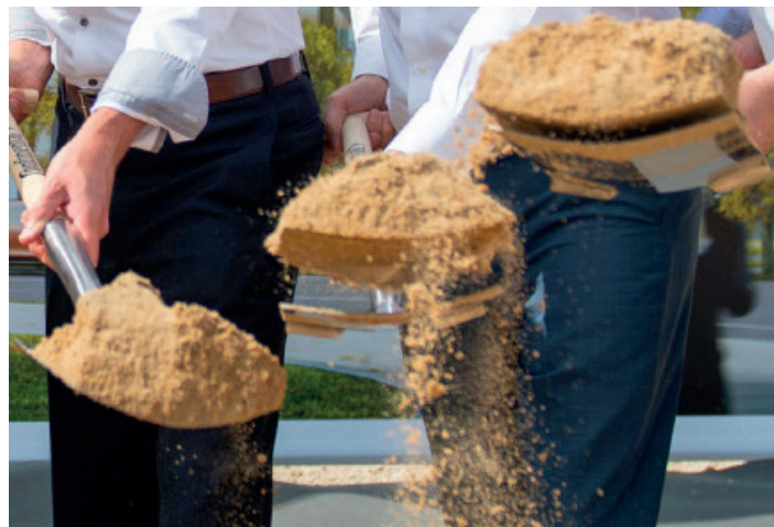
first shovel of earth ritual in building processes

perspective on what gift giving could be for the inhabitants of this newly developed area. within this proposal we're introducing the idea of a commons as a shared welcoming gift. this is an object that will become communal property of all the inhabitants of a residential building. for every new incoming inhabitant of the building the gift can be activated with a welcoming ritual, inviting neighbours to interact with one another in a social play of which they can design the rules. "hosting soil: as a gift" is an invitation and at the same time a gift that could be seen as a precious moment for grounding, connection and creativity. it is an act of care and offers space for expression and activation of impact of the new inhabitants.