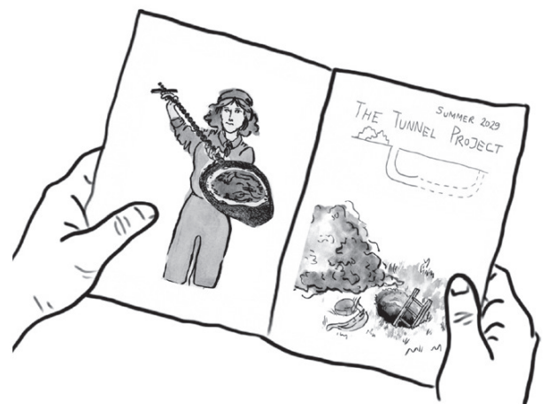
sketch for logbook