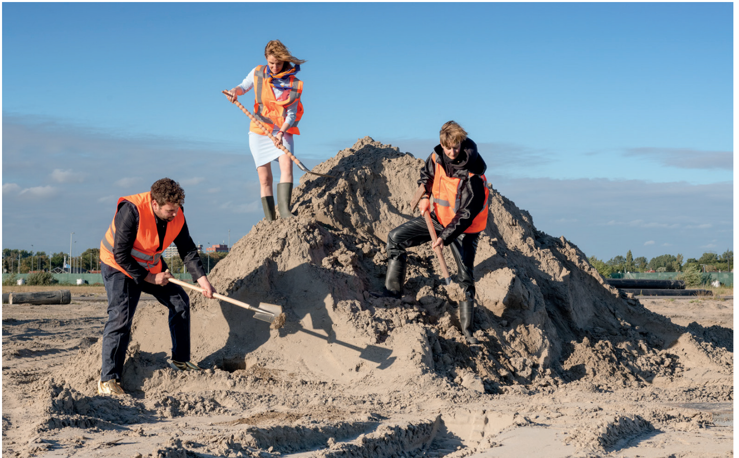
testing shovels in sluisbuurt

with their hosting soil performance they are keen to introduce the public to a sculptural scenography that is built on the premise of temporality and use of the human body. hosting soil is rather a scripted situation than a long lasting structure, and engages with the people passing through public space. the idea for the performance is based on an ongoing research by the artists about ways of commoning, solidarity and labor or striking as women to activate change.